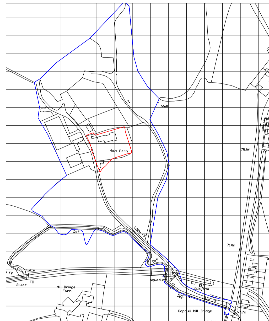
Location Plan 1:2500

General notes: Do not scale the drawing. All dimensions to be checked on site prior to commencement of work and any discrepancy shall be immediately reported and resolved prior to work commencing. This drawing is to be read in conjunction with all relevant drawings and specifications relating to the job whether or not indicated on the drawing. Copyright reserved to WBD this drawing may not be used or reproduced without prior written consent.