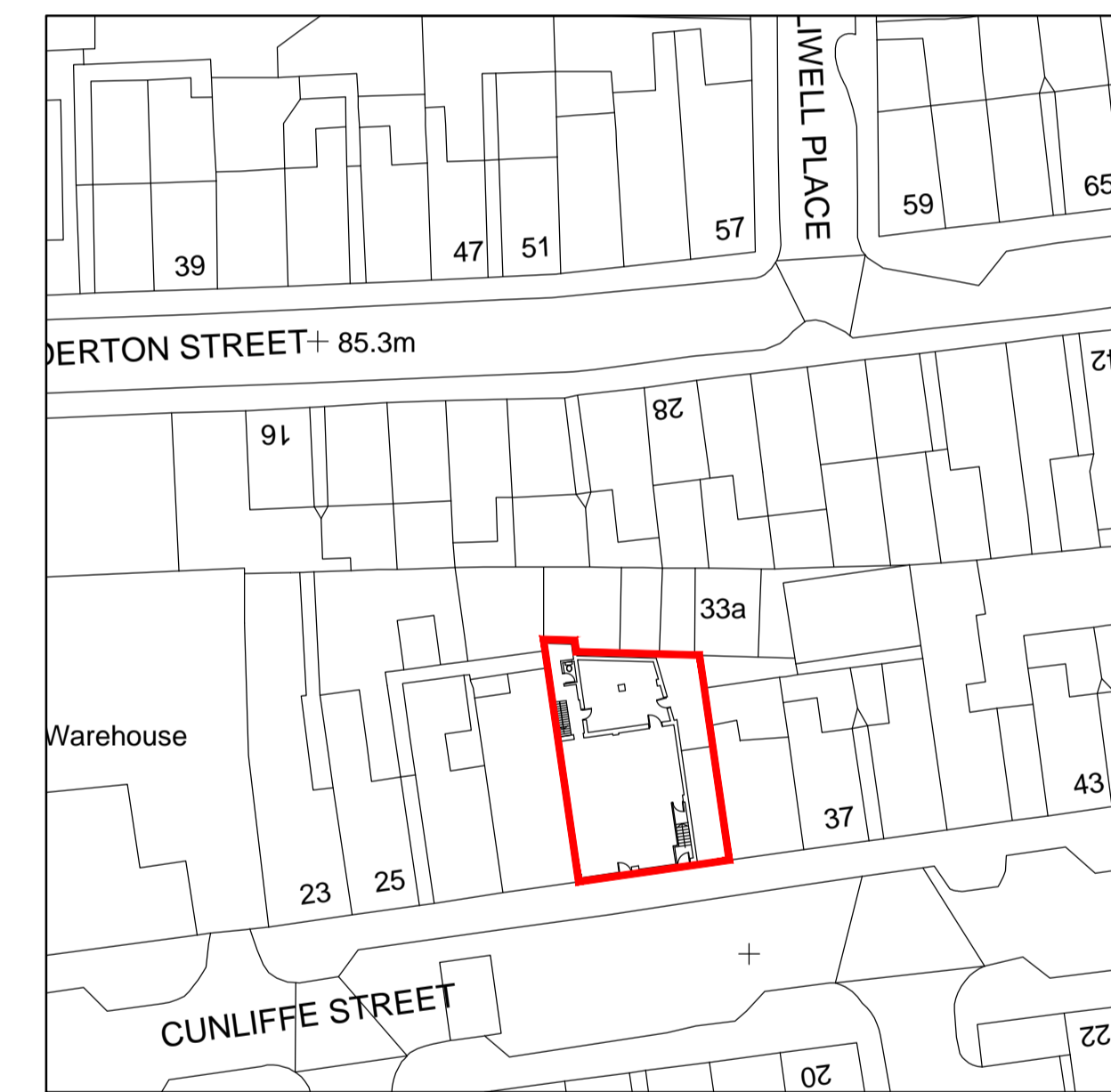
SITE PLAN AS EXISTING SCALE 1:500