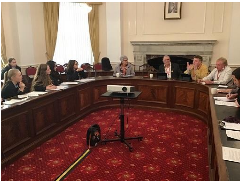
Students met with Members of the Task Group to discuss the issue of climate change and raise their concerns.

Students from Parklands High School visited the Town Hall: