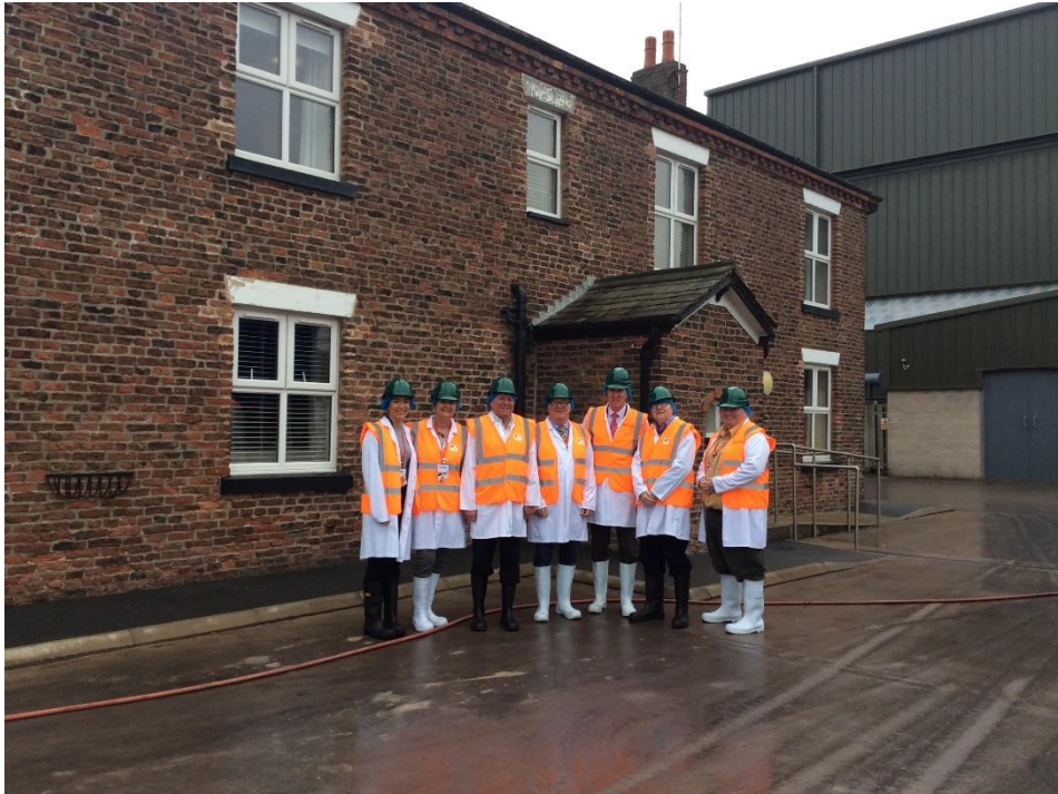
Site Visit to GA Pet Food Partners Manufacturing Site in Bretherton

Students from Parklands High School visited the Town Hall: