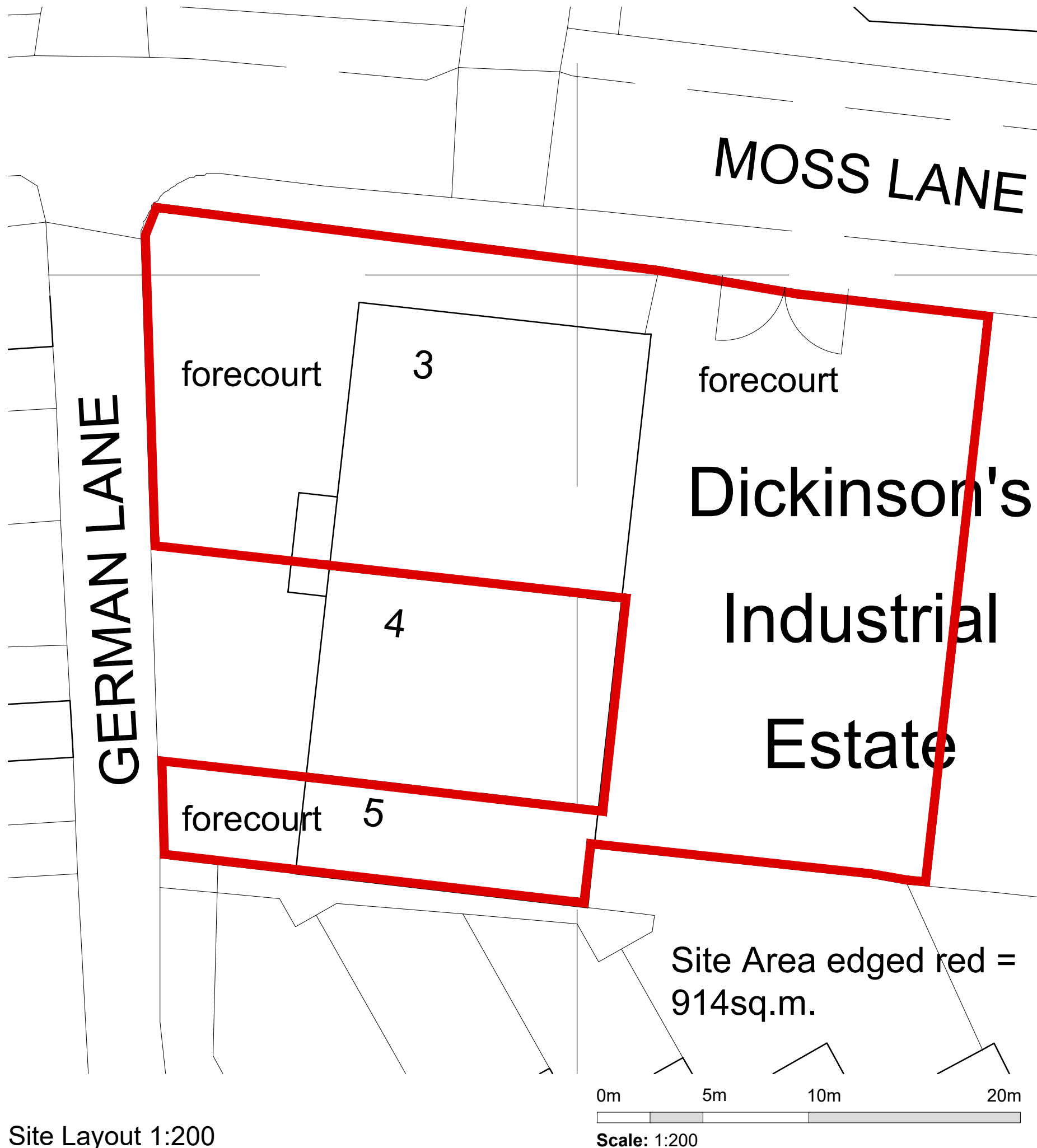
Site Layout 1:200