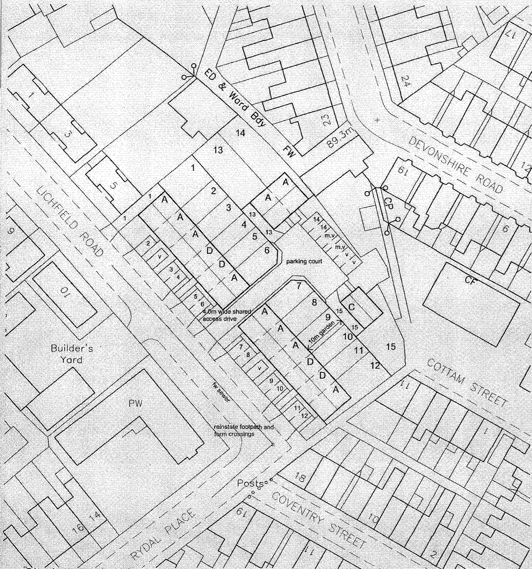
Site Layout 1:500