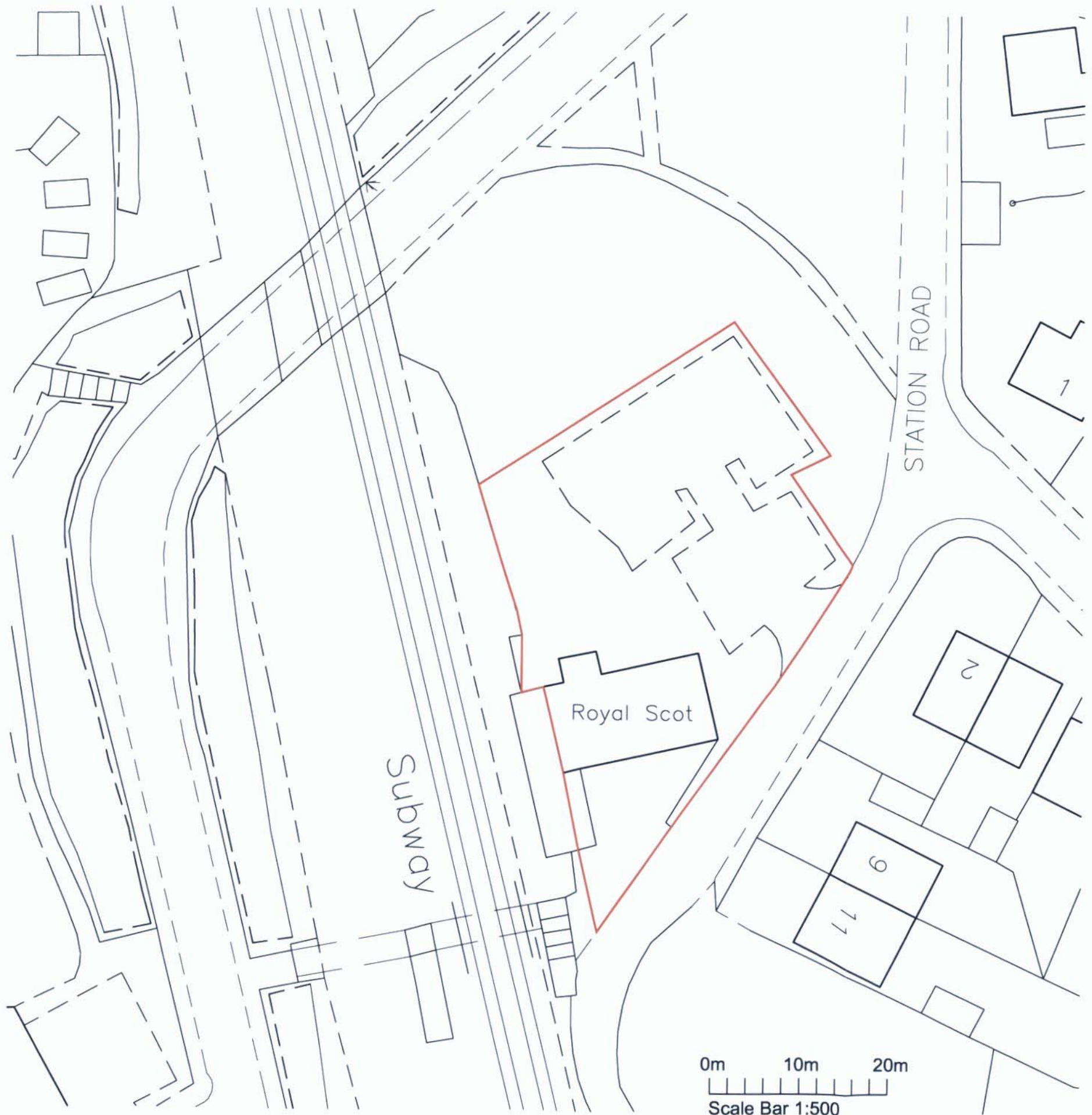
Site Layout 1:500

THIS IS THE PLAN REFERRED TO IN APPLICATION No. 10/00746/FUL