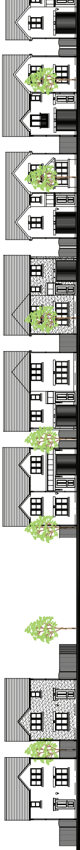
Plot 43 Plot 44 Plot 49 Plot 50 Plot 51 Plot 52 Plot 53 Plot 54