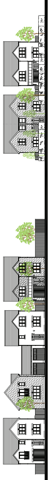
Plot 56 Plot 57 Plot 58 Plot 59