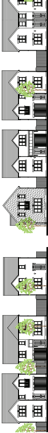
Plot 4 Plot 5 Plot 6 Plot 10 Plot 11 Plot 12 Plot 13 Plot 14 Plot 16