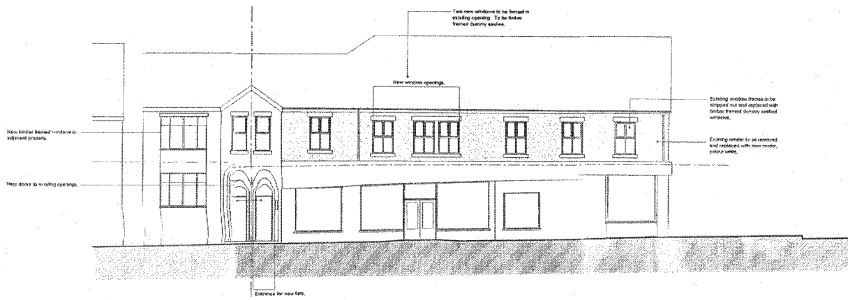
Front Elevation Scale 1/100