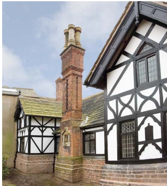
Part of the Restored Timber Work from the 2004/05 Project