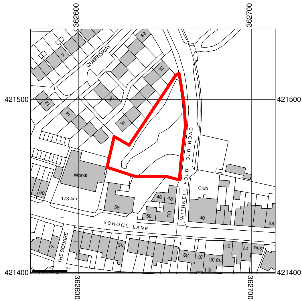
1 Site Location Plan 1 : 1250